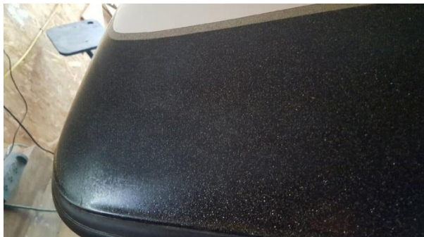
Dull and Faded Before