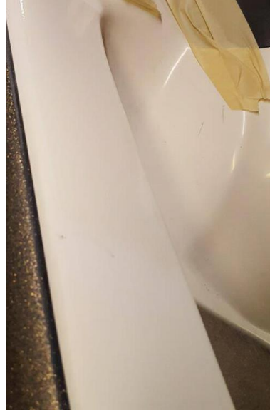
Much Better Now!