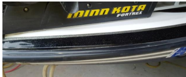
Much Better After