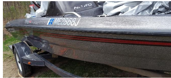
All Buffed Out