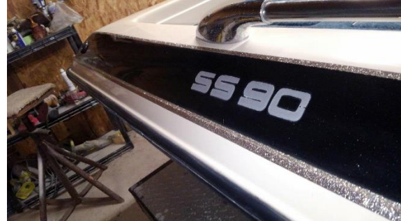
Much Nicer Shine After