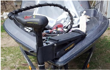
Before and After, See the Difference?