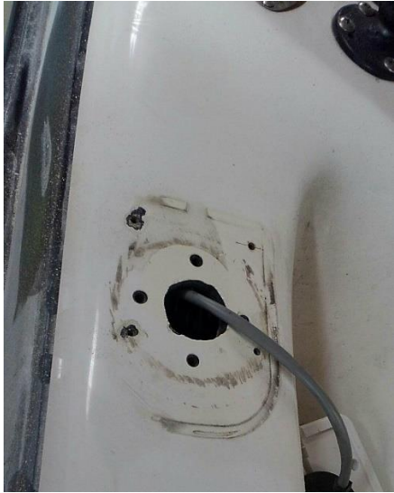
Dealer Install of Satellite Antenna

Facebook - https://www.facebook.com/Eds-Gel-coat-Restoration-963848427114285/