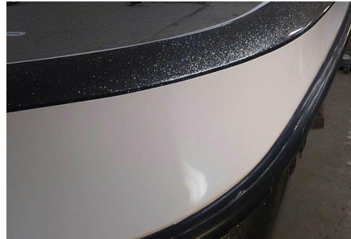
After Wet Sanding