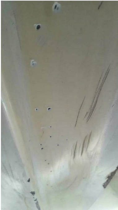
Now that's a banged up Bottom