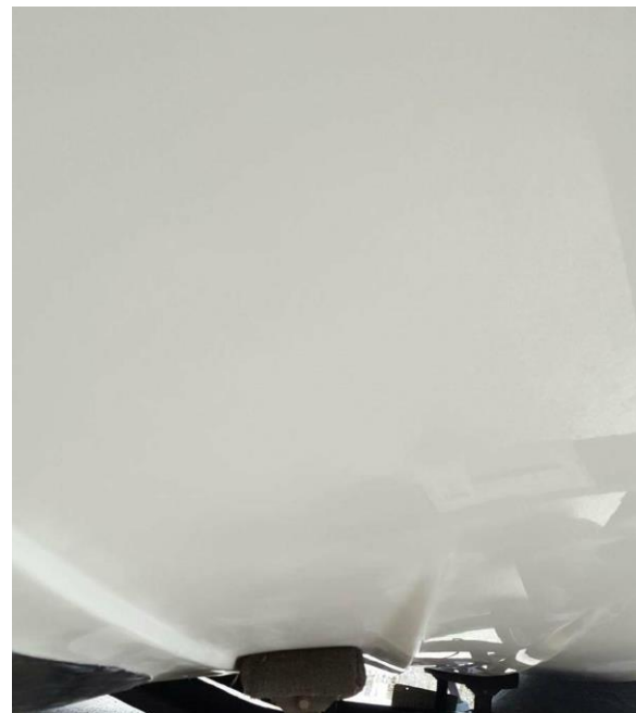
Repaired looks New!