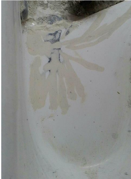
Spider Cracks Before