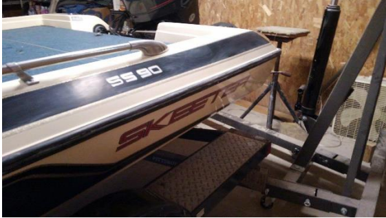
Dull and Faded Before

Facebook - https://www.facebook.com/Eds-Gel-coat-Restoration-963848427114285/